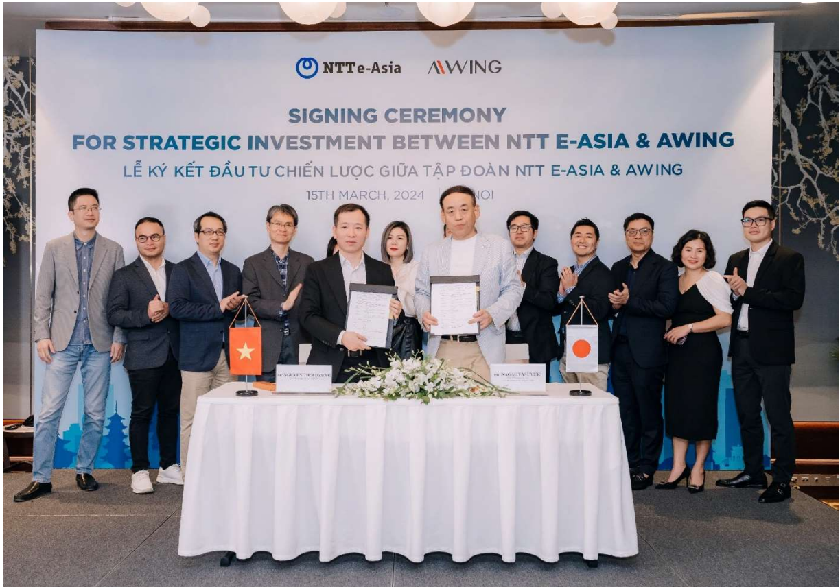
Signing Ceremony (March 15 th , 2024)