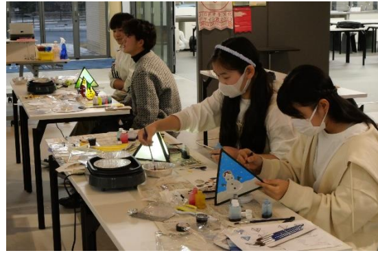
Nebuta production at the Tokyo venue