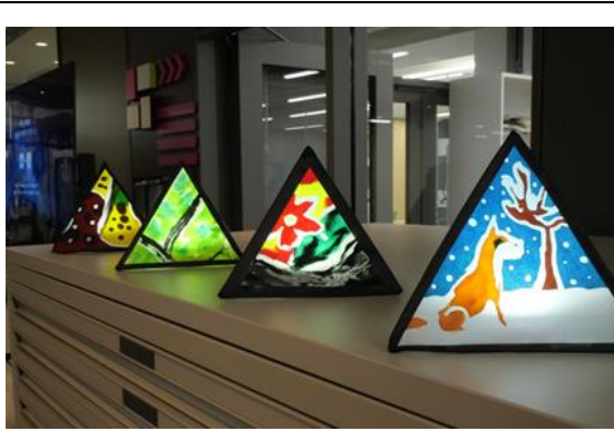
Unveiling of the completed Nebuta