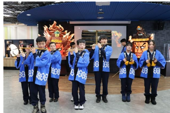
Demonstration of "Ohayashi" performance at the Aomori venue