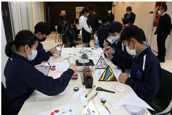
Nebuta production at the Aomori venue